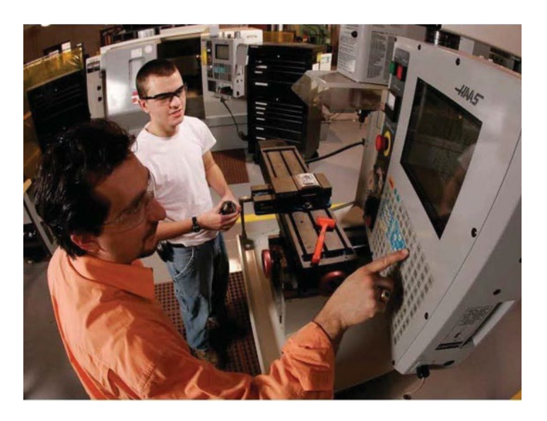
Goal 2: Jamestown Community College's Manufacturing Technology Institute was funded in part with ARC grants.

Chenango County was featured in ARC's Strengthening Economic Resilience Guidebook 2019 for its collaborative support of its lengthy tradition of small manufacturers.<sup>4</sup>