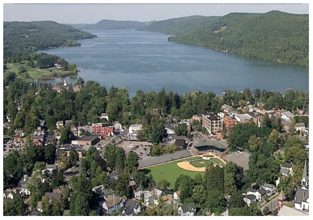
Otsego Co. has seen many collaborations between NYS's ARC and Local Government Efficiency Programs. Its Career Opportunities in Rural Education (CORE) initiative shares services for STEM education across multiple school districts.